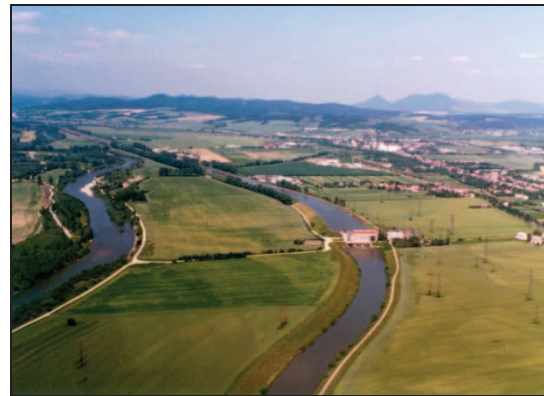
Fig. 2 HPP Ladce