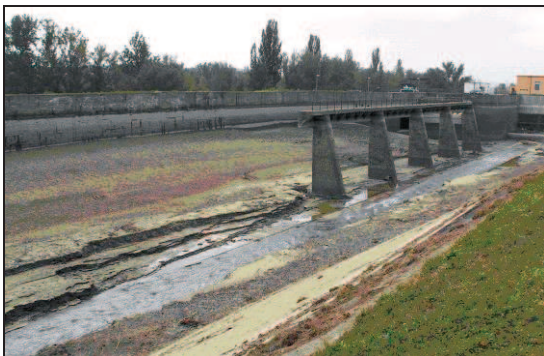
Fig. 9 Sediments in front of HPP Horná Streda