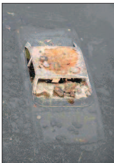
Fig. 11 Car in intake channel