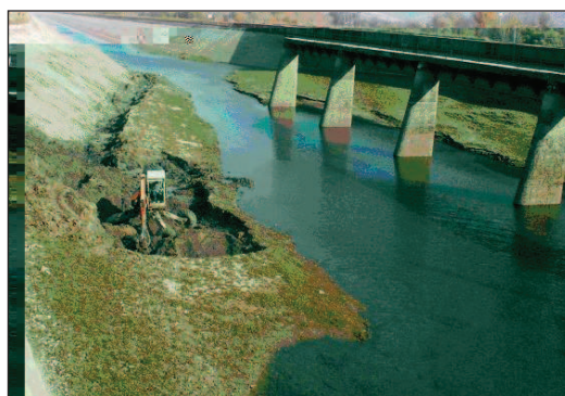
Fig. 8 Sediments in front of HPP Nové Mesto

After 20 years of operation, in summer 2005, had been the group of HPPs Kostolná – Nové Mesto – Horná Streda inspected and repaired. The inspection confirmed bad conditions of the water structures and showed the causes of deterioration of hydraulic roughness in channels, which leads to decreasing of hydropower potential utilisation of the river Váh. The conditions in the channels are shown at following figures.