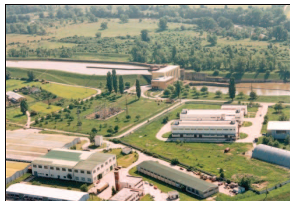
Fig. 6 HPP Horná Streda

The intake channels of the HPP group Ladce – Ilava – Dubnica – Trenčín have trapezoid cross-section with bottom width about 18,3 m and water-side slope 1:1,75. They are sealed by facial concrete sealing. The bottom width of outlet channels varies from 8 to 15,4 m. There is not any channel lining under the minimal operation water level and the slope of the banks is 1:3. The maximal turbine capacity