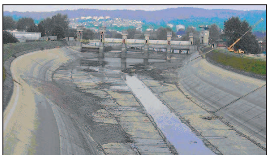
Fig. 7 Sediments behind intake structure Trenčianske Biskupice

The measurement was realized as planned and the measured data were supplemented with measurement of the operator of the HPPs.