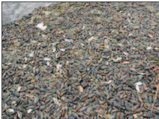
Fig. 10 Clams in intake channel