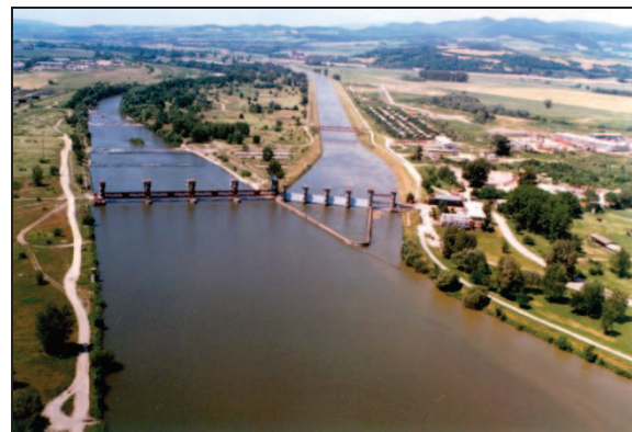
Fig. 4 WS Trenčianske Biskupice – weir and intake structure of intake channel for HPP Kostolná