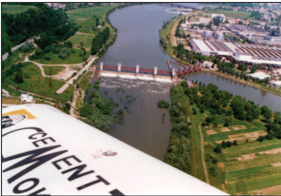
Fig. 1 WS Dolné Kočkovce – weir and intake structure of the intake channel for HPP Ladce

the upstream HPP. Also the HPPs are operated simultaneously, meaning that these HPPs operate with discharge, which is let in the whole scheme at the entry of this stage by the first intake channel and hydropower plant (pilot HPP). In this case it is the HPP Ladce.