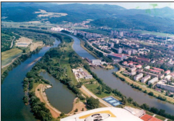
Fig. 3 HPP Trenčín