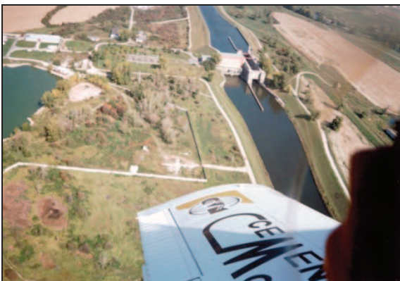
Fig. 5 HPP Kostolná