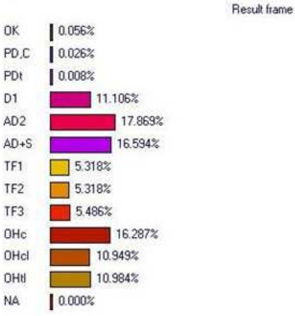
Figure 3 Final result of evaluation.

Five results are collected together to get only one final result according to Table I and Table II. Result frame is shown on Fig. 3